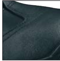
RTC with countersunk seams